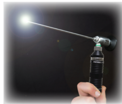
Rigid Endoscope with Portable Light Source sold separately